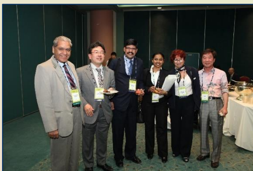
Delegates of 2 nd ACRR @ Seoul, South Korea 2009