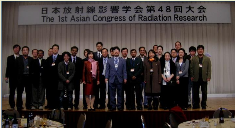
Group Photo of 1st ACRR-2005

The 1 st ACRR in 2005 was organized jointly by the Japanese Association for Radiation Research and the Japanese Radiation Research Society; The participants were from wide range of scientists from radiation research fields including physics, chemistry, biology, industrial establishments, medical and environmental sciences. It was held during 16-17, November 2005 at International Conference Centre, Hiroshima, Japan. The 1 st Asian Congress of Radiation Research was attended by 110 researchers from 11 countries.