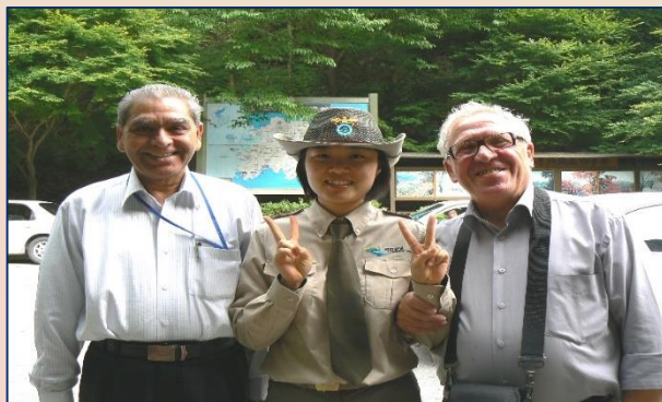
Delegates of the 3 rd ACRR at Beijing, P.R.China