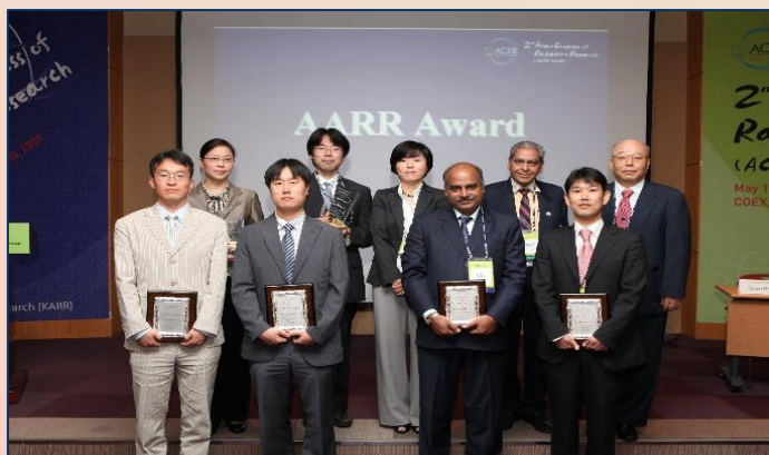
Recipients of AARR Awards 2009